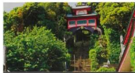
#25 SHINSHOJI TEMPLE

Approx. 10km from Temple #23, this is the first stop for pilgrims in Kochi Prefecture.