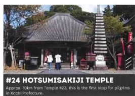
#24 HOTSUMISAKIJI TEMPLE

Approx. 10km from Temple #23, this is the first stop for pilgrims in Kochi Prefecture.