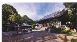
#26 KONGOCHOJI TEMPLE

Approx. 6.5km from Temple #24, this temple has prospered as a place of worship for the fishermen who embark from the port.